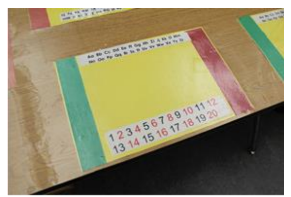
Placemat to help stay focused and organized