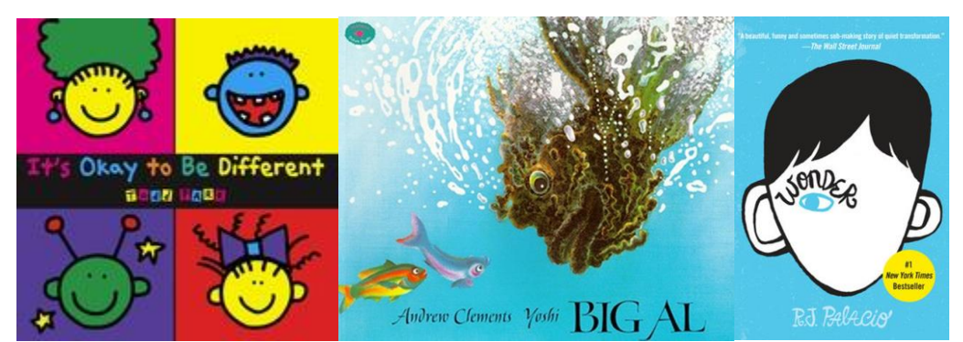
Atheneum Books for Young Readers ( Big Al ); Little, Brown Books for Young Readers ( It's Okay To Be Different ); Knopf Books for Young Readers ( Wonder )